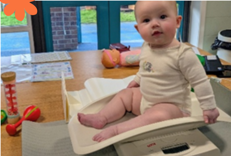
Here's one of our younger participants getting measured at our Doncaster location